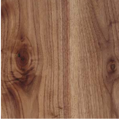
noce canaletto canaletto walnut