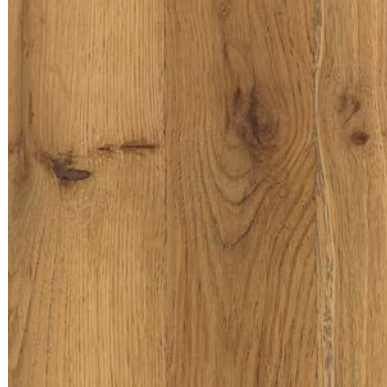
rovere "old" "old style" oak